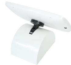
Table Top Swivel